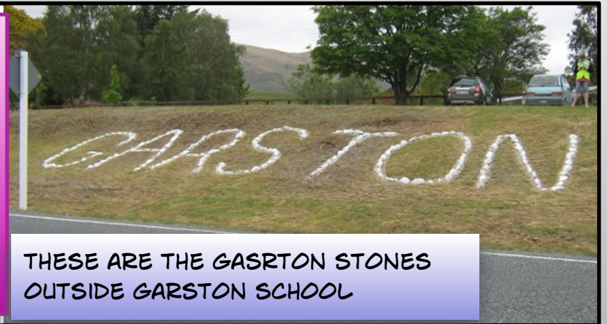
THESE ARE THE GASRTON STONES OUTSIDE GARSTON SCHOOL

GARSTON SCHOOL IS THE SCHOOL THAT I USED TO GO TO. IT HAS 32 PUPILS THIS YEAR. THEY TAKE YEAR 1 TO 8S AND LAST YEAR THERE WERE ONLY 2 YEAR 8S. THE SCHOOL IS 130 YEARS OLD AND I WENT TO THE 125TH JUBILEE. GARSTON SCHOOL HAS BEEN CHANGED OVER THE LAST 5 YEARS SUCH AS BECOMING THE ELEVENTH ENVIRO SCHOOL IN SOUTHLAND AND THE ACTIVITIES THAT HAVE BEEN HAPPENING OUTSIDE OF SCHOOL. THEY ARE CURRENTLY BUILDING A NEW LIBRARY AND THEY WILL BE EXPANDING THE JUNIOR ROOM INTO THE OLD LIBRARY.